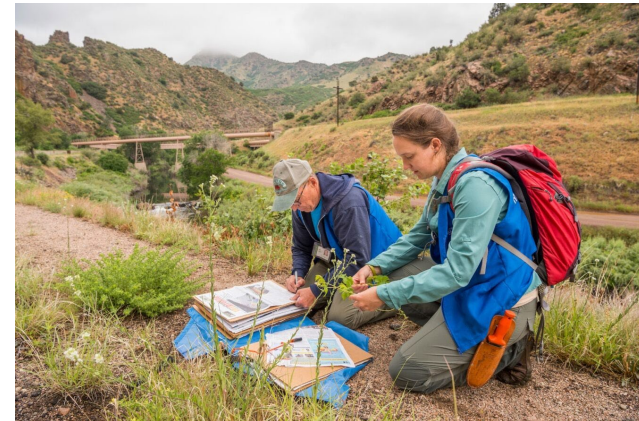
Center for Plant Conservation