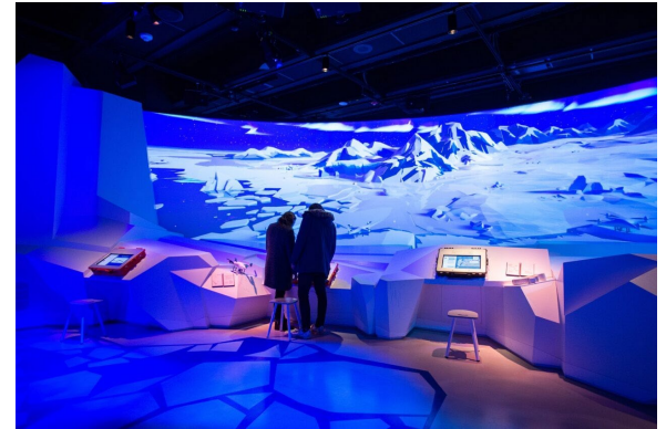
Museum of Science, Boston

Emphasis is on broad impact in the field.