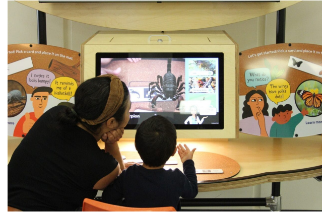
The Lawrence Hall of Science

The Notice of Funding Opportunity offers complete instructions on how to prepare and complete all application components.